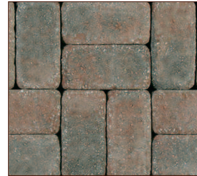
OAKS BLEND HERITAGE™ SERIES