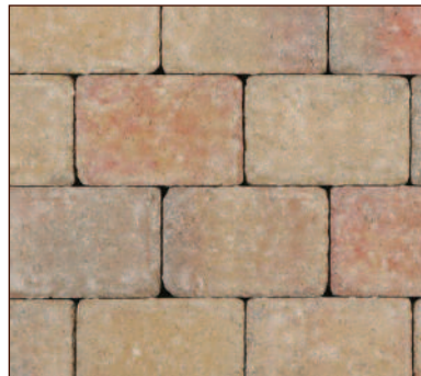
OLD TOWN BLEND HERITAGE™ SERIES