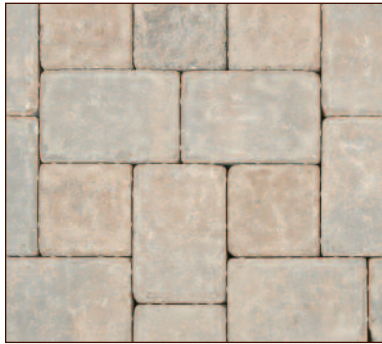
AUTUMN BLEND HERITAGE™ SERIES