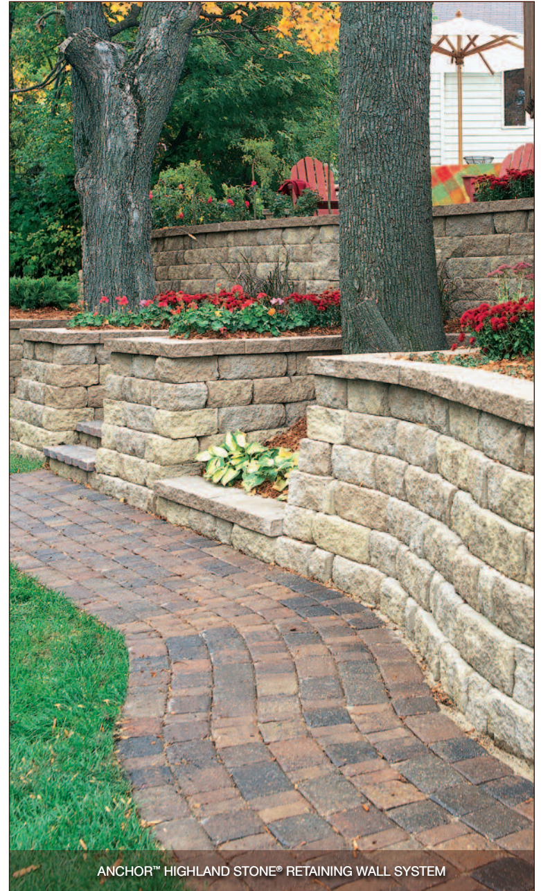
ANCHOR ™ HIGHLAND STONE ® RETAINING WALL SYSTEM

NOTE: Not all colors are available in all products.