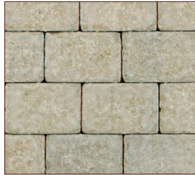
BUFF HERITAGE™ SERIES