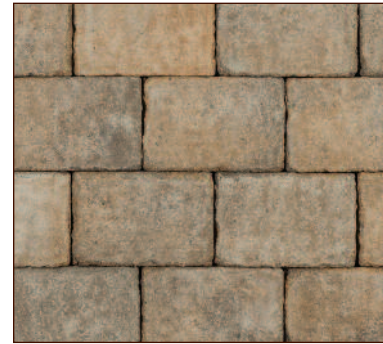
CAROLINA BLEND HERITAGE™ SERIES