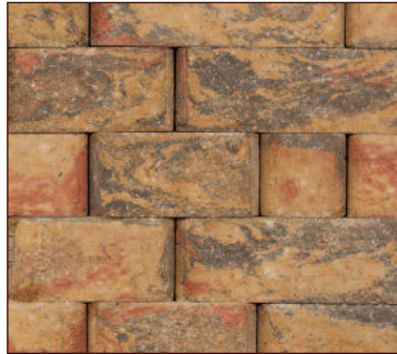
OLD TOWN BLEND