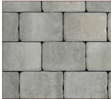
CHICAGO BLEND HERITAGE™ SERIES