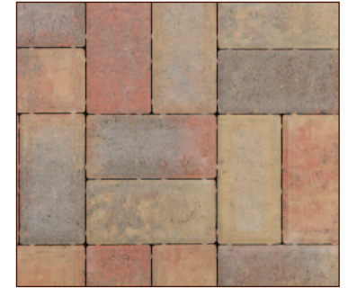
OLD TOWN BLEND