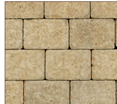
SANDSTONE BLEND HERITAGE™ SERIES

NOTE: Not all colors are available in all products.