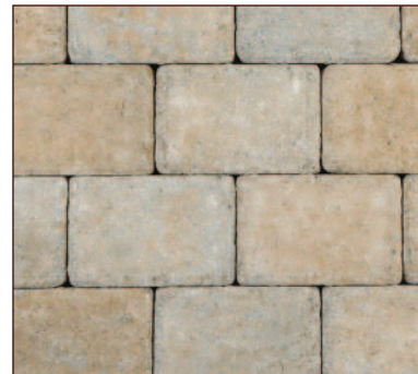
RIVERTOWN BLEND HERITAGE™ SERIES