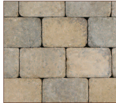
EARTH BLEND HERITAGE™ SERIES