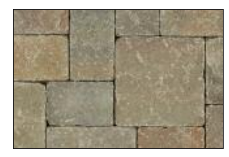
Earth Slate Blend Heritage™ Series