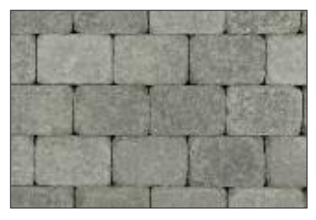
Chicago Blend Heritage™ Series

Color combined with quality makes Pavestone Company the choice for concrete pave stones.