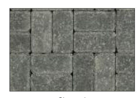
Charcoal Heritage™ Series