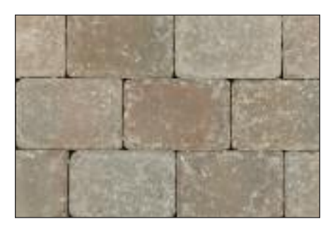
Old Town Blend Heritage™ Series