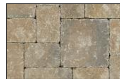
Eddington Blend Heritage™ Series