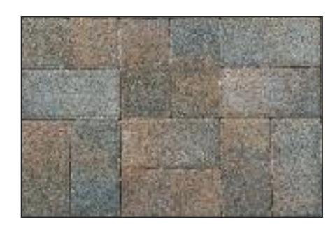
Old Town Blend Heritage<sup>™</sup> Series Concrete Pave Stones