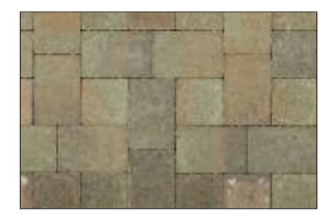
Earth Slate Blend