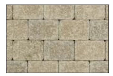
Earth Blend Heritage™ Series