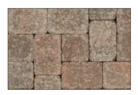
Oaks Blend Heritage™ Series