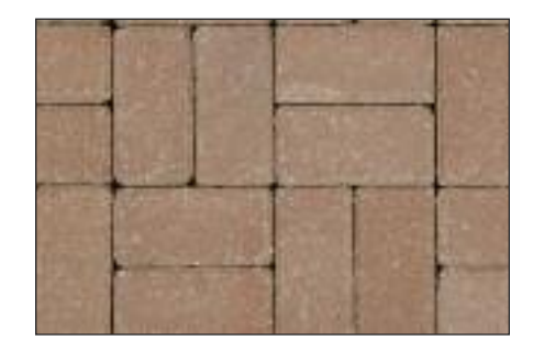
River Red Heritage™ Series