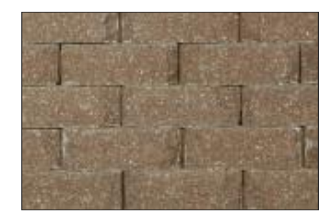
Terra Cotta Blend

Color combined with quality makes Pavestone Company the choice for concrete retaining walls.