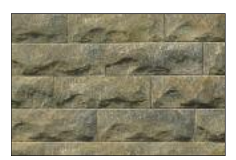
Copper / Tan