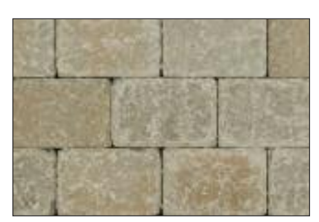
Rivertown Blend Heritage™ Series