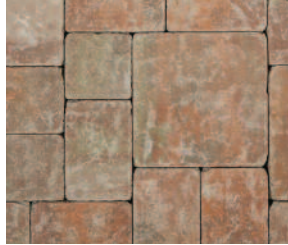
SEQUOIA CANYON, PLAT. HERITAGE™ SERIES, TUMBLED