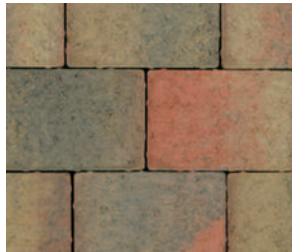
OLD TOWN BLEND