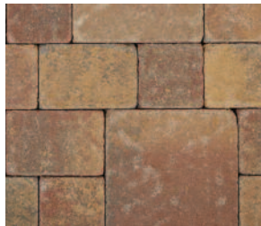
SIERRA BLEND HERITAGE™ SERIES, TUMBLED