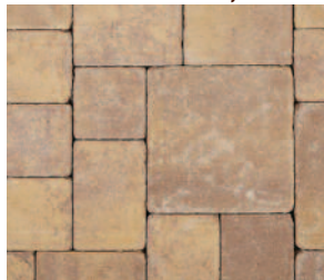
SANDSTONE BLEND HERITAGE™ SERIES, TUMBLED