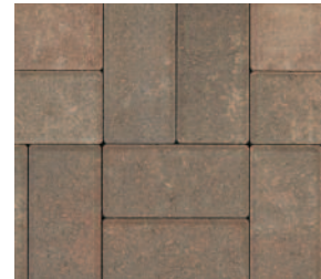
SAND BROWN CHARCOAL