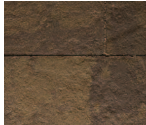
YOSEMITE BLEND PLATINUM SERIES