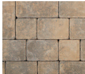
TAN/CHARCOAL BLEND HERITAGE™ SERIES, TUMBLED