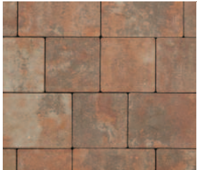
SEQUOIA CANYON BLEND PLATINUM SERIES