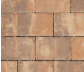
ABBRONZA BLEND PLATINUM SERIES