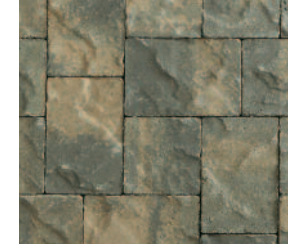
SAN MIGUEL BLEND PLATINUM SERIES