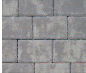
GRANITE BLEND PLATINUM SERIES