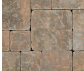
TAHOE BLEND, PLAT. HERITAGE™ SERIES, TUMBLED

NOTE: Not all colors are available in all products.