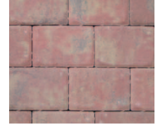
SANTA FE BLEND PLATINUM SERIES