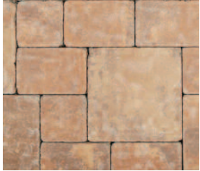
ABBRONZA BLEND, PLAT. HERITAGE™ SERIES, TUMBLED