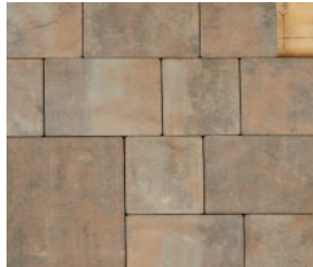
TAHOE BLEND PLATINUM SERIES