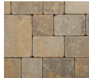
TRUCKEE BLEND HERITAGE™ SERIES, TUMBLED

NOTE: Not all colors are available in all products.